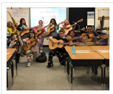
Club Time- Guitar Club!