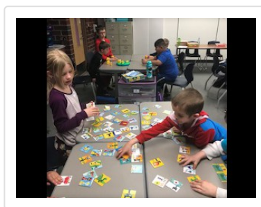
Club Time- Strategy and Math Games!