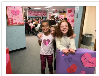
Respite Care Cafe