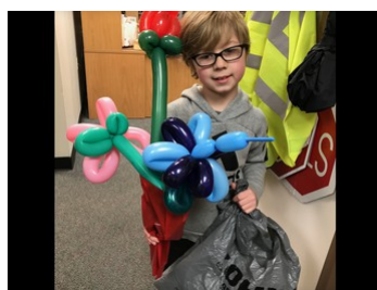
Jack's Balloon Flowers!