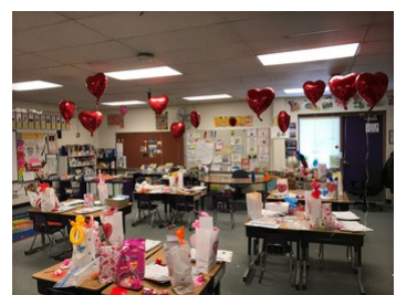
Happy Valentine's Day!